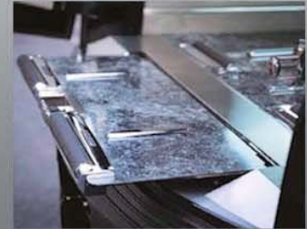
Table Extender Protection System with 90° rollers.