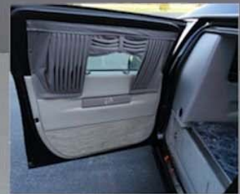
Deluxe drapery and embroidered Cadillac wreath accentuate the side doors.