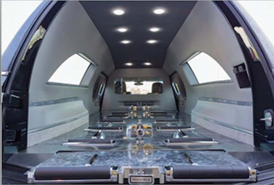
Luxury interior with elegant accents and floor.

Due to continuous improvement, Accubuilt reserves the right to change standards and specifications without notice or price adjustment.